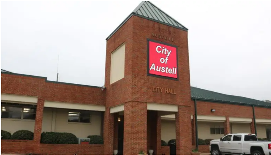
Austell City Hall